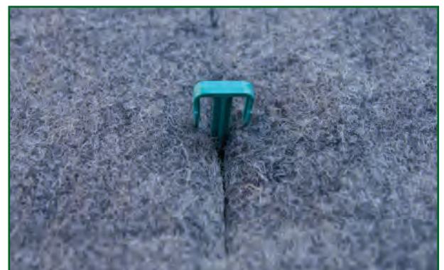
BioPin™ designed for anchoring Erosion Control Blankets and Turf