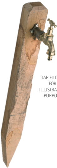
TAP FITTING FOR ILLUSTRATION PURPOSE